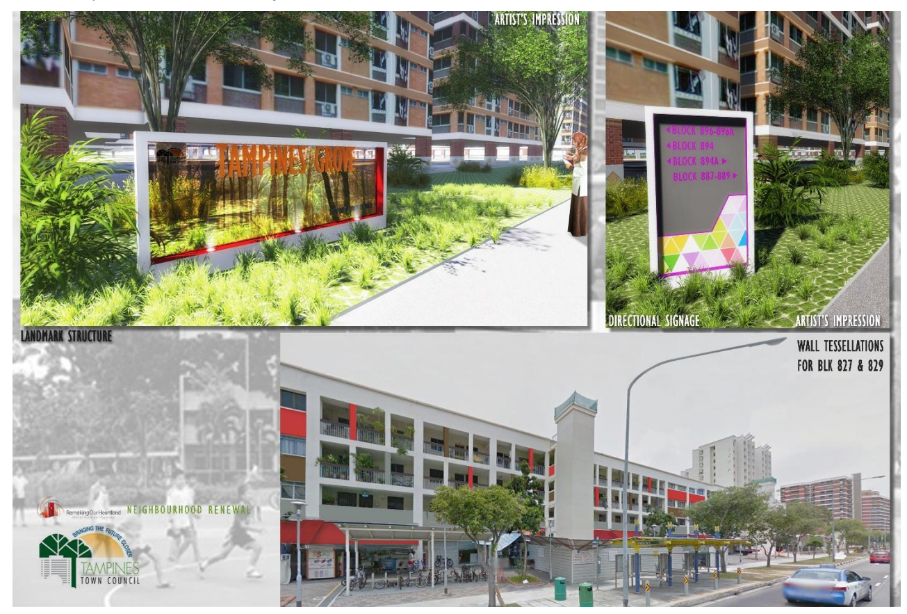
Artist's impression of landmark features