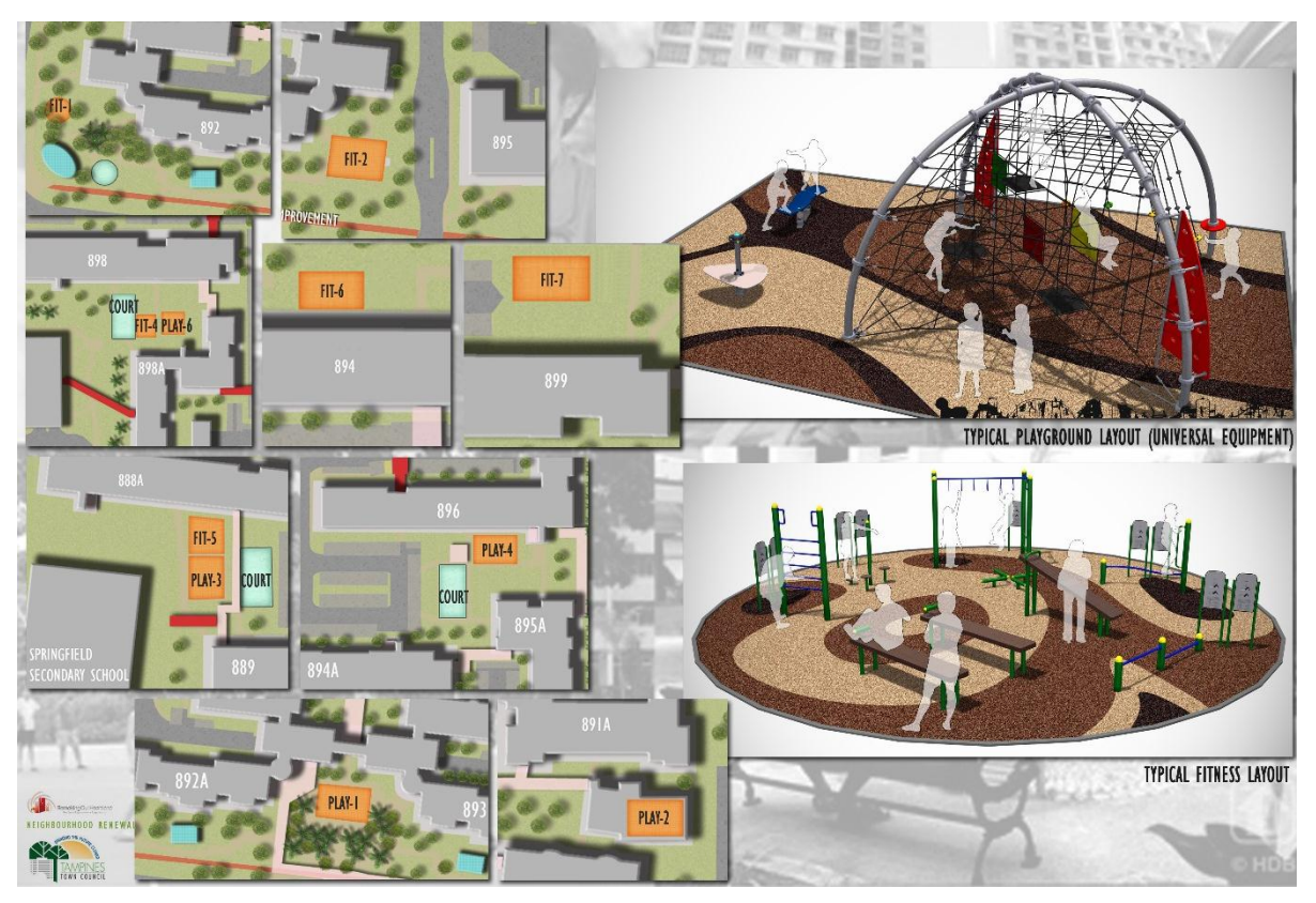
Artist's impression of fitness area