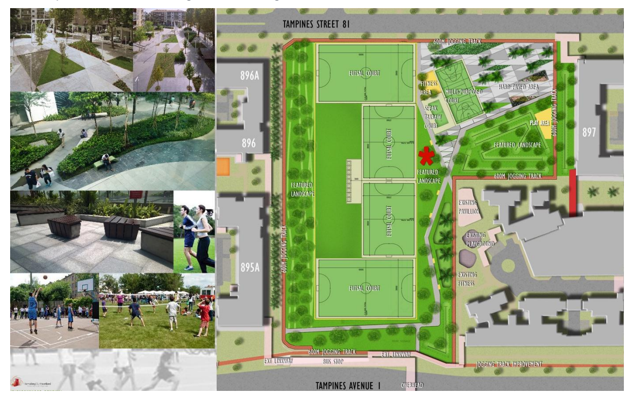
Artist's impression of where the new proposed temporary futsal courts, multi-purpose courts that will be built along Tampines Street 81.