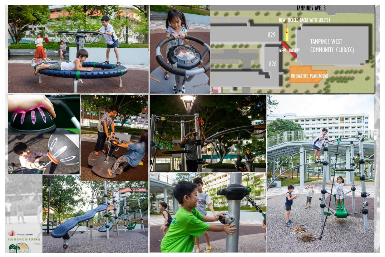
Artist's impression of playground